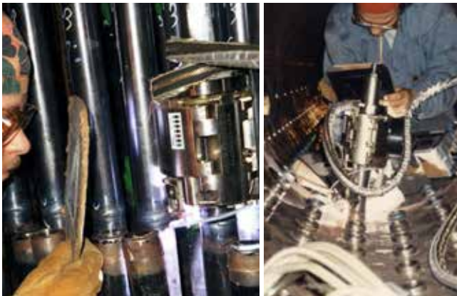
MODEL 81 WELD HEAD IN AVC/TILT VERSION WELDING INSIDE THE MUD DRUM