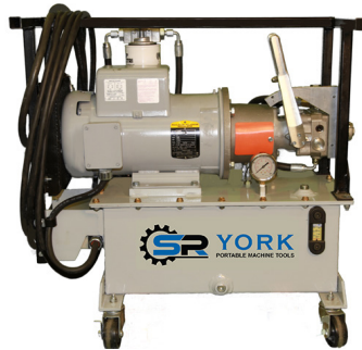
5 HP Unit