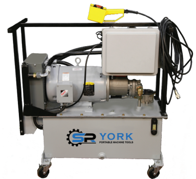
10 HP Unit w/ Pendant Remote